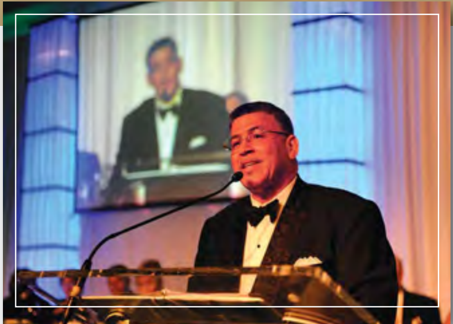
Cayman's new Premier addresses well-wishers at a UDP gala in his honor at The Ritz-Carlton Grand Cayman ballroom.

In the meantime, he returned to his businesses, yet did not disappear from the public eye. He joined a campaign to