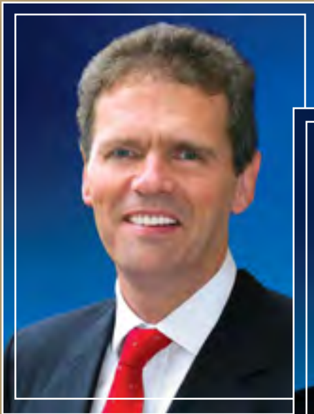
HIS EXCELLENCY THE GOVERNOR DUNCAN TAYLOR